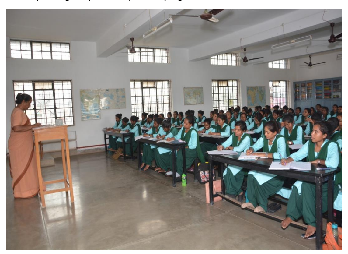
Students having essay writing competition