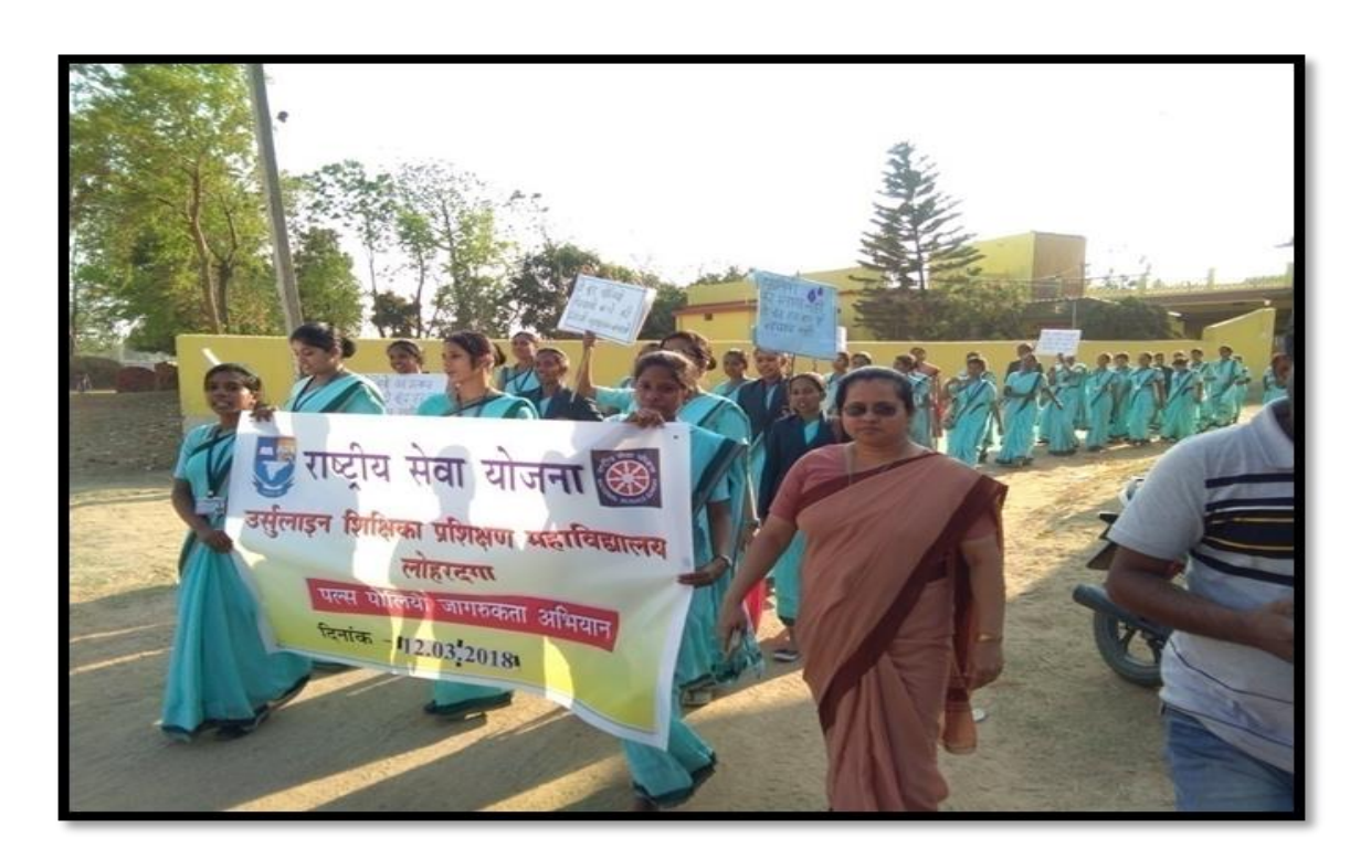
Teachers and Students having awareness yatra