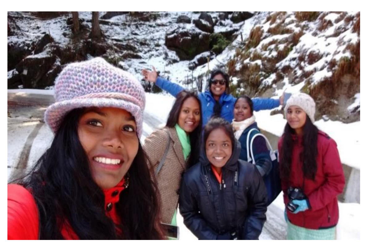
Educational Tour of students