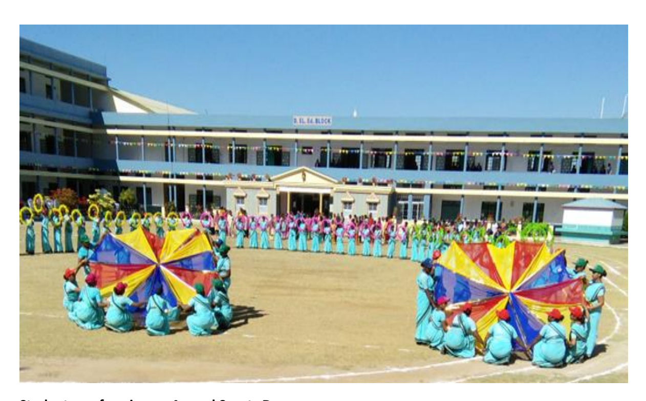
Students performing on Annual Sports Day