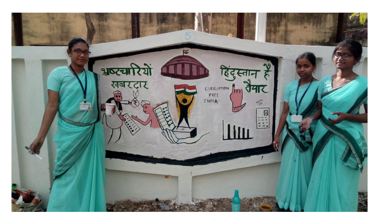
Drawing by our students on the boundary wall of D.C. office