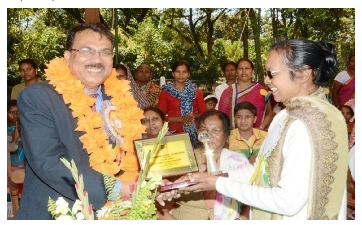
Giving prize on Annual Sports' Day