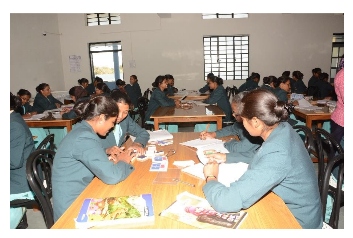
Students' group discussion