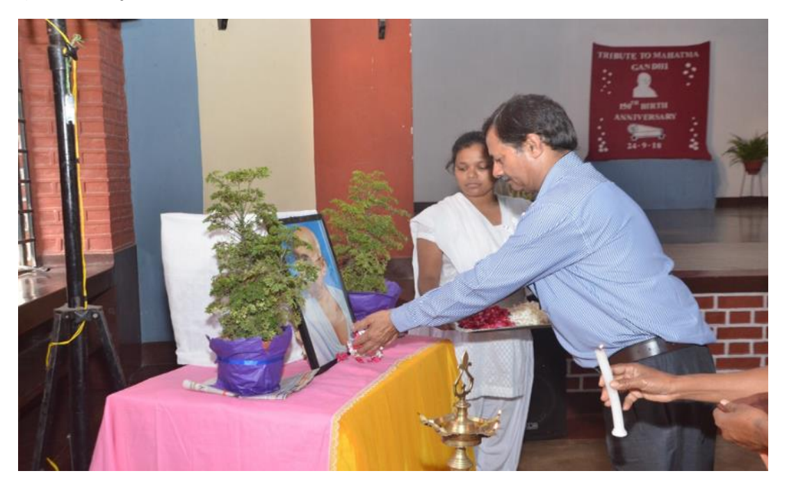
Lighting of the lamp by chief guest of Gandhi Jayanti Celebartion