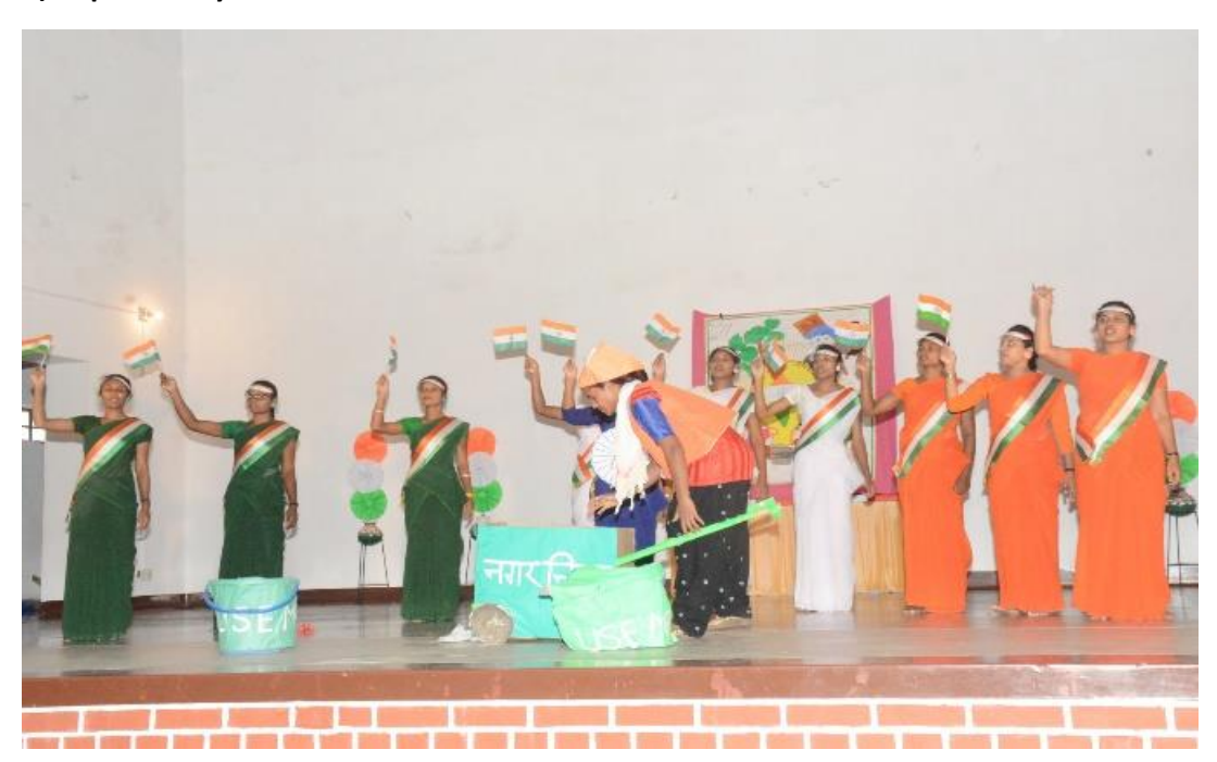
Students performing an Act on Republic Day