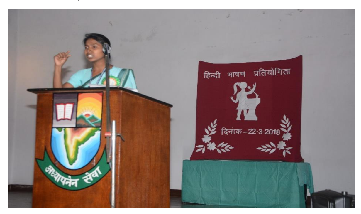
Hindi elocution competition