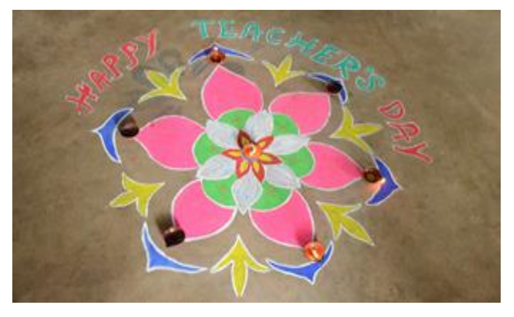
Alpana made by students