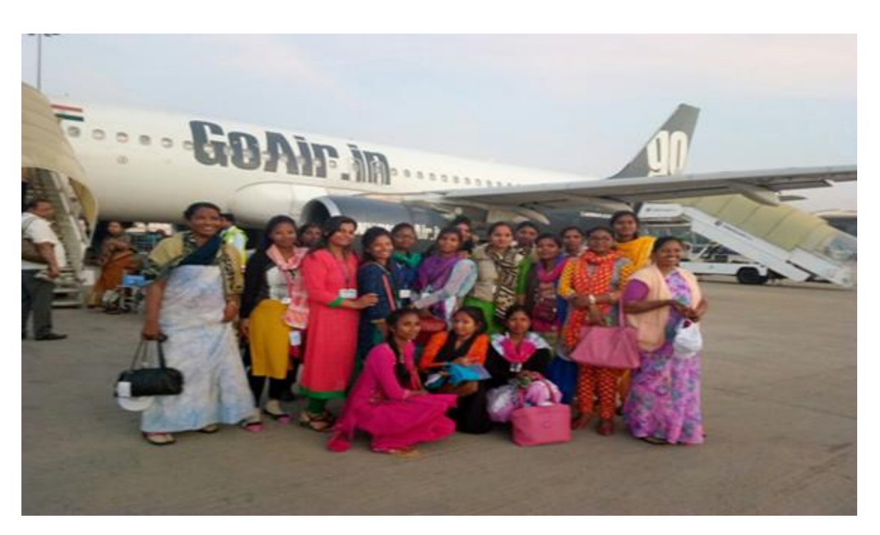
Educational Tour of students