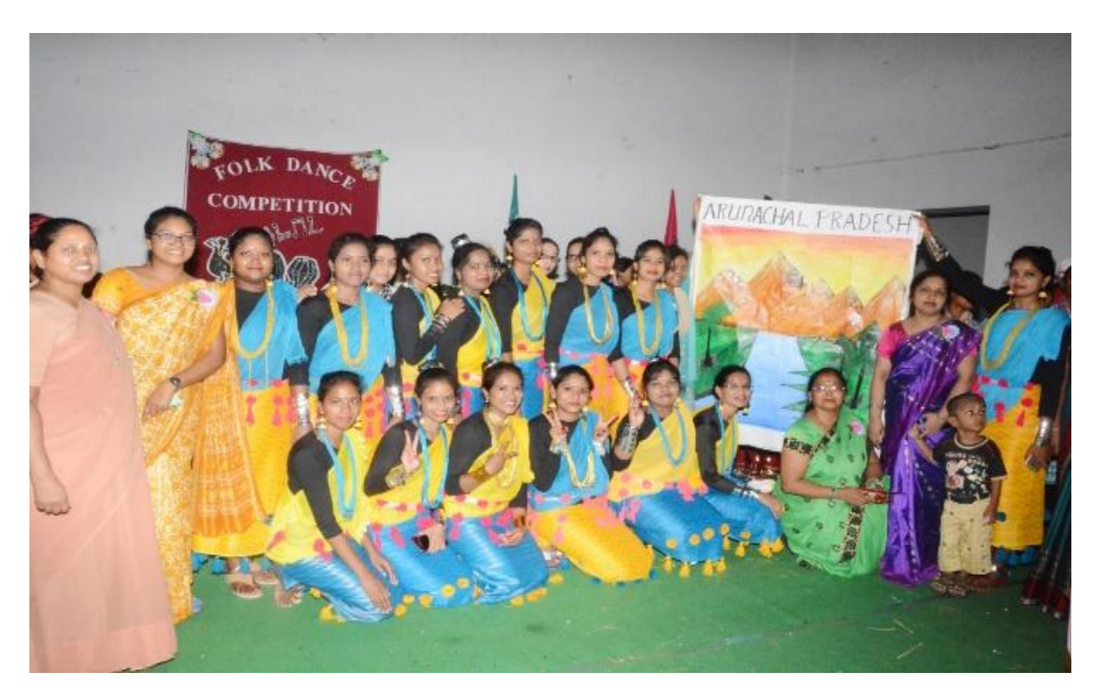
Students performing folk dance