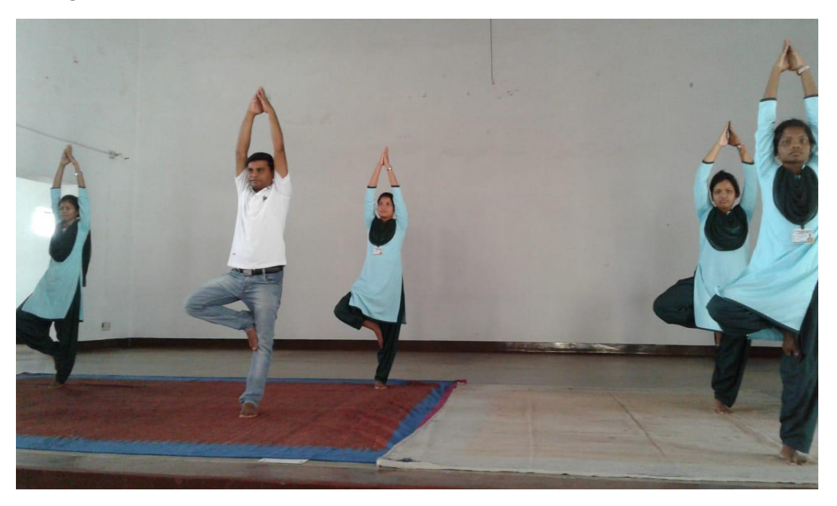
Teacher and students having Yoga