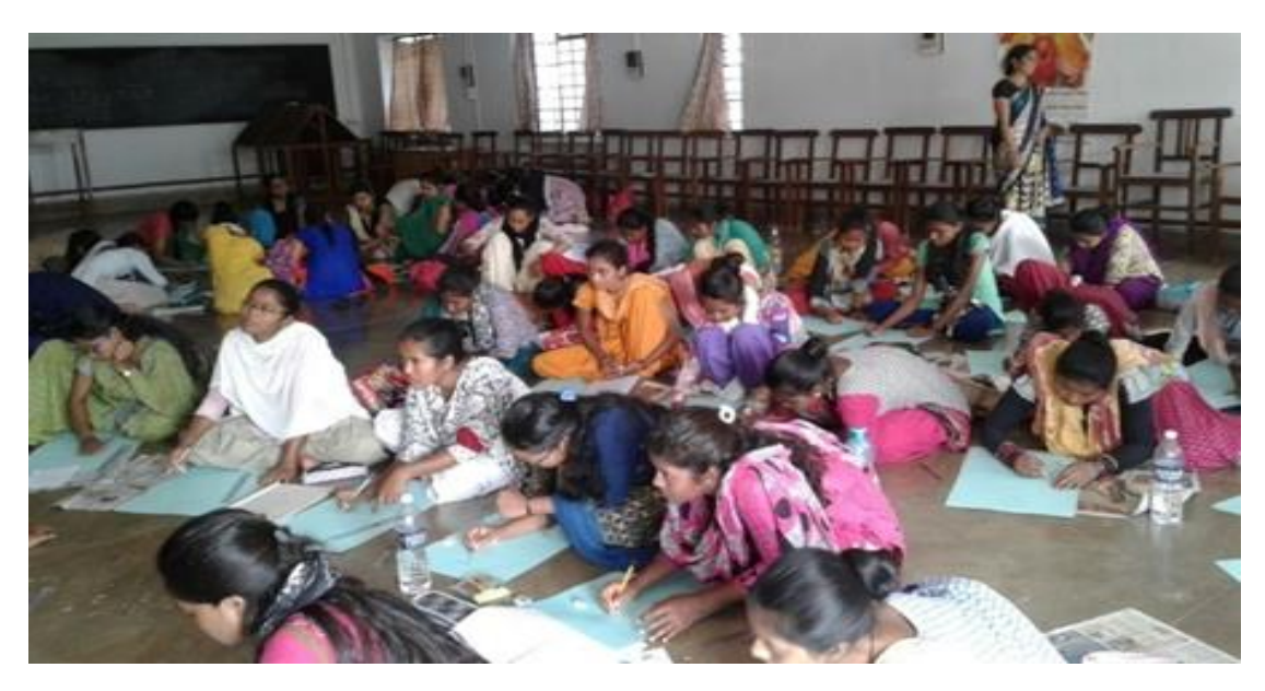
Students having drawing competion