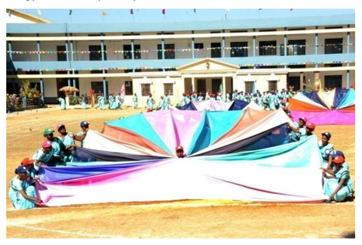
Performance of students Annual Sports Day