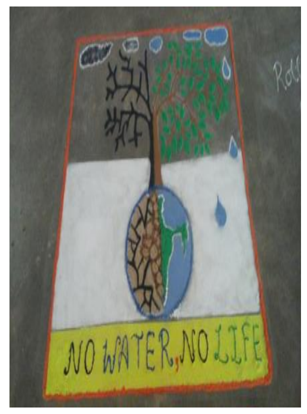
Rangolis made by students