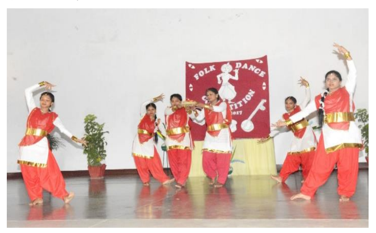
Students performing folk dance