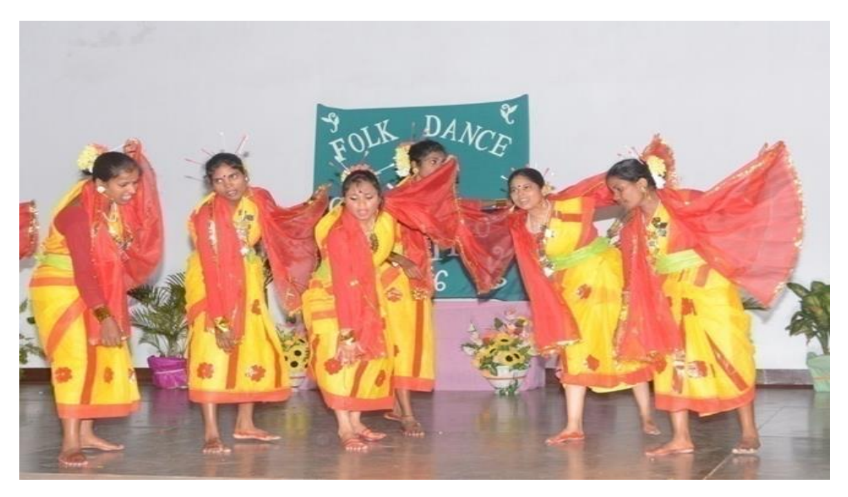
Students performing folk dance