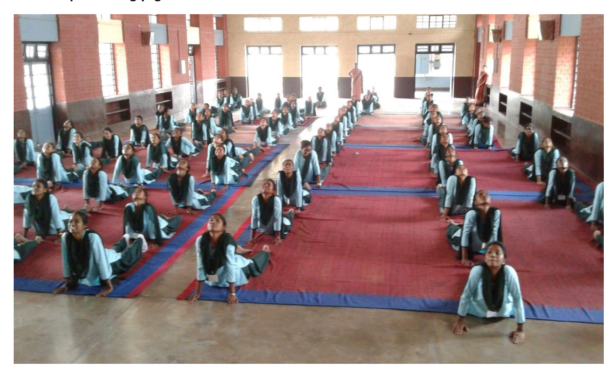
Students performing yoga