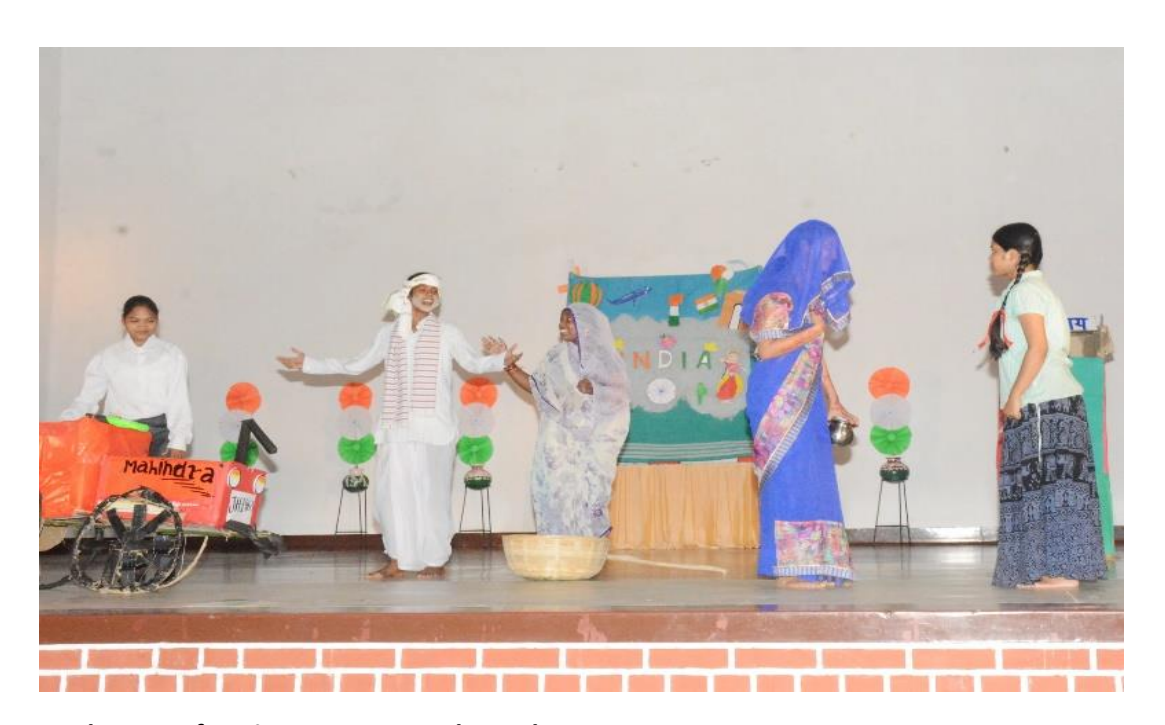
Students performing an act on Independence Day