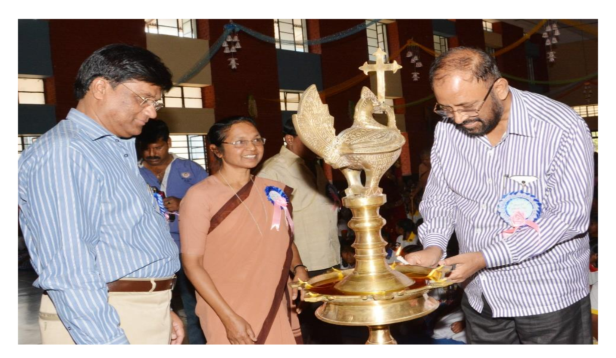
Lighting of the lamp on College annual day