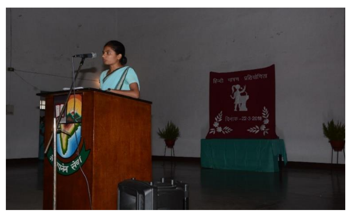
Hindi elocution competition