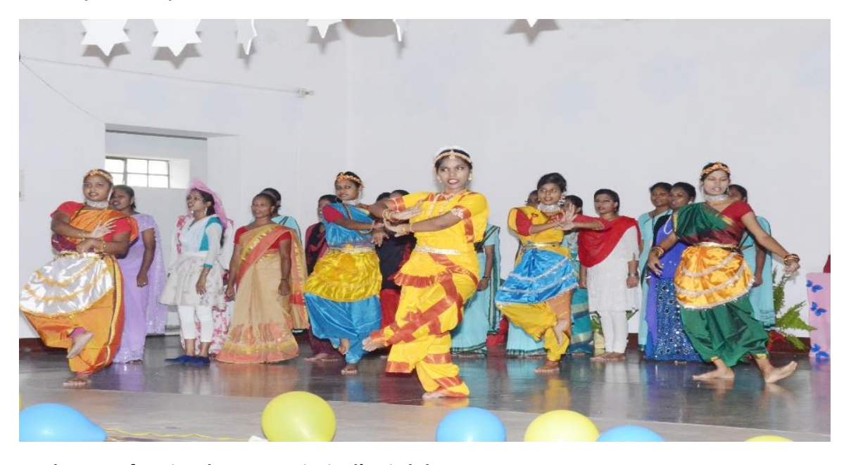
Students performing dance on Principal's Birthday