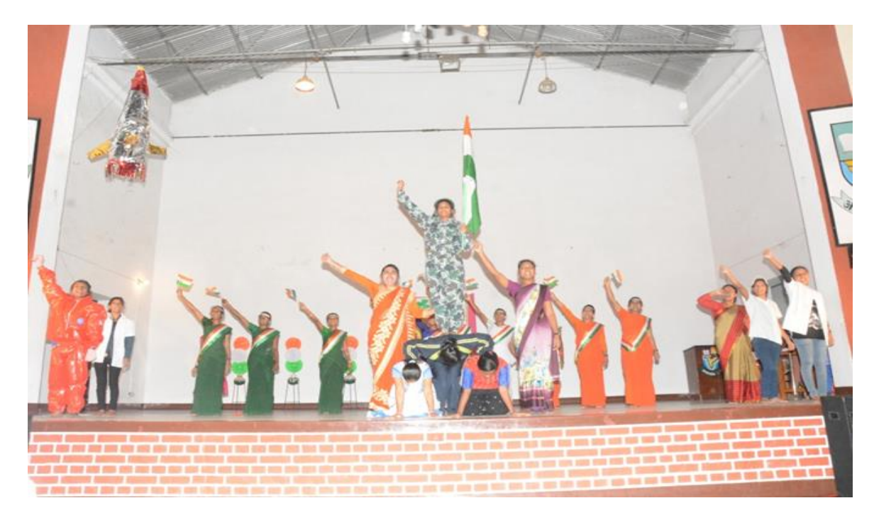
Patriotic Song competition