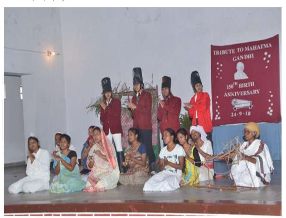
Students performing drama on Gandhi Jayanti Celebration