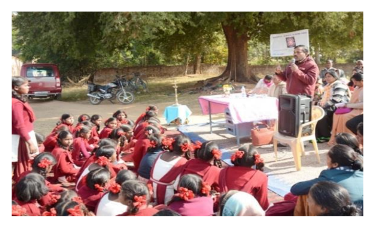
Instruction is being given to school students