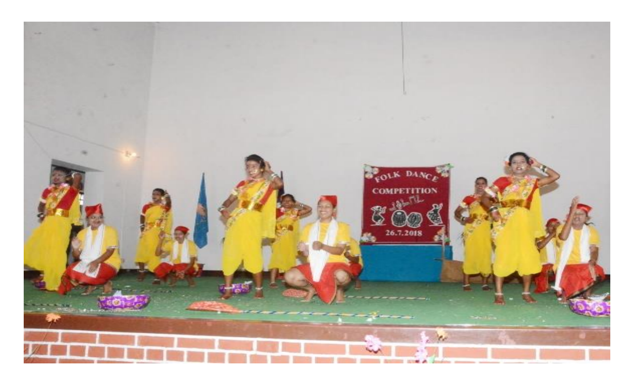
Students performing folk dance