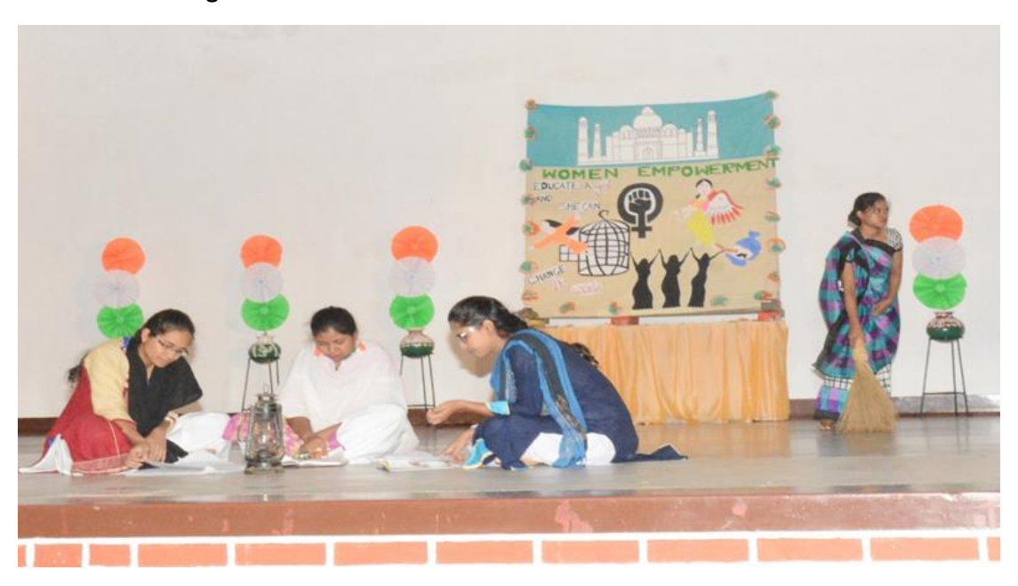
B.Ed. students performing for school students