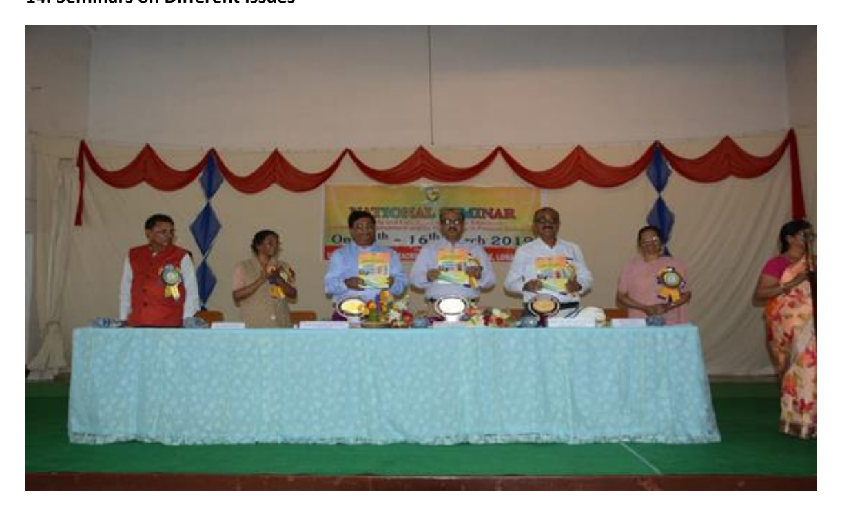
Having National Seminar in the college