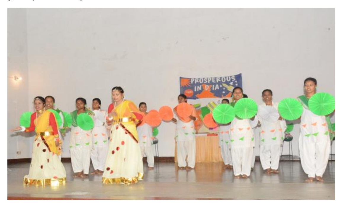
Students performing dance on Independence Day