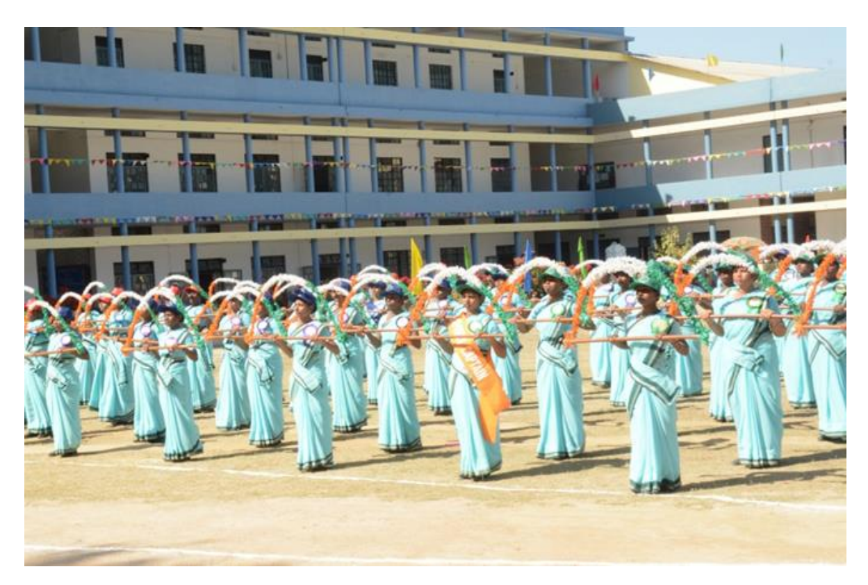
Students performing on Annual Sports Day