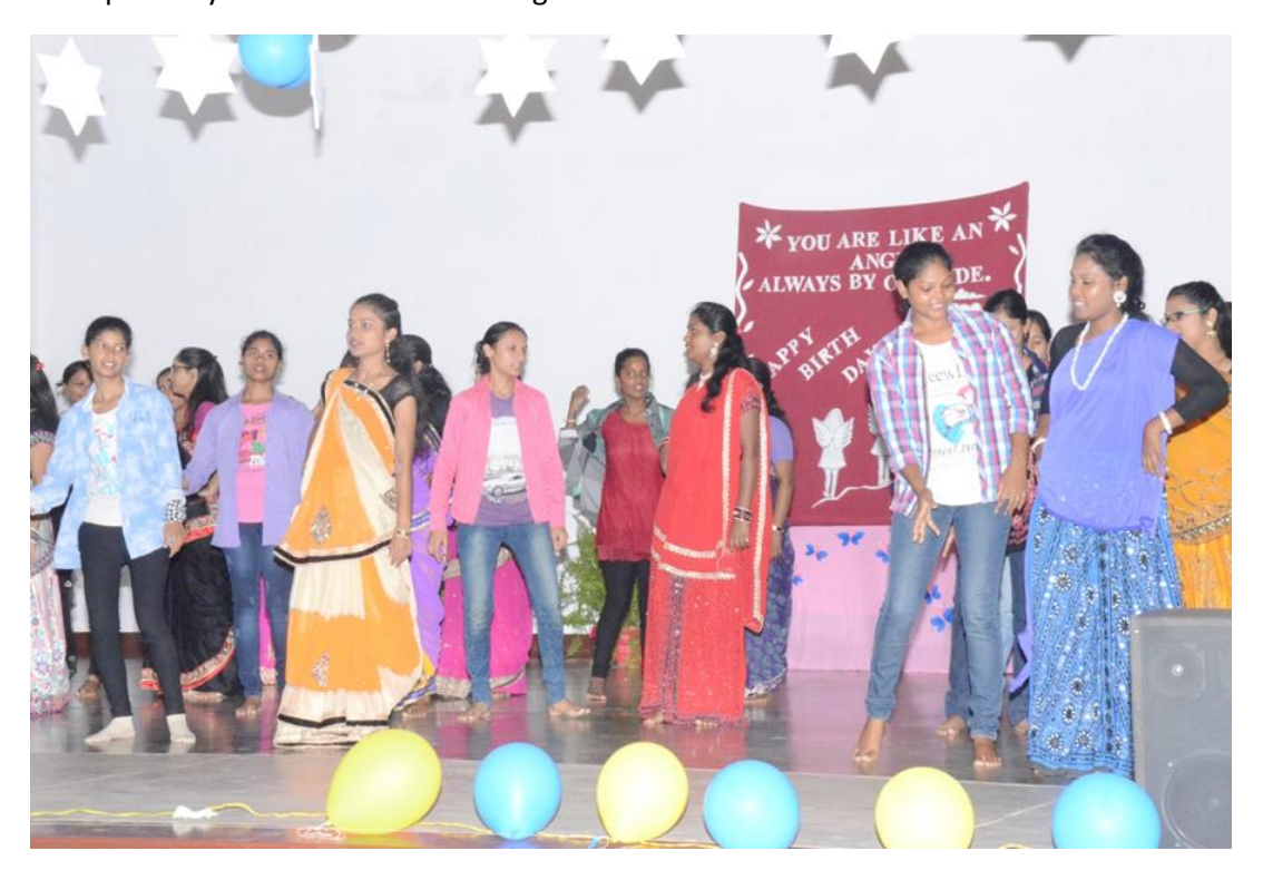
Students performing dance on Principal's day