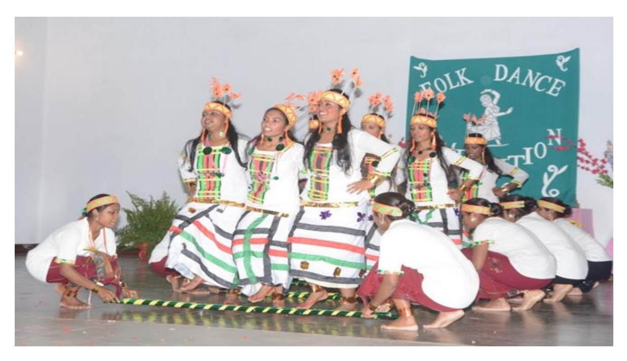
Students performing Bamboo dance