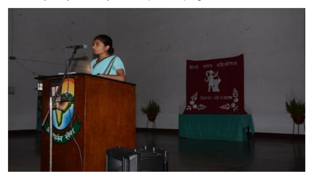
Having extempore speech