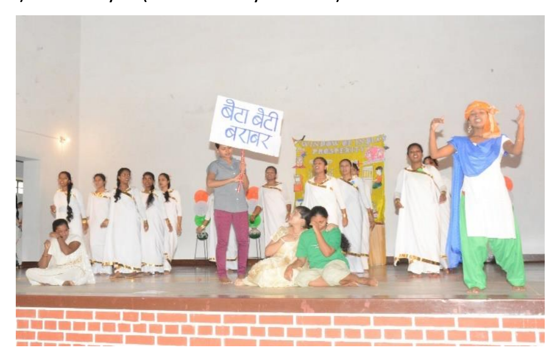
Students performing an Act on Ambebkar Jayanti