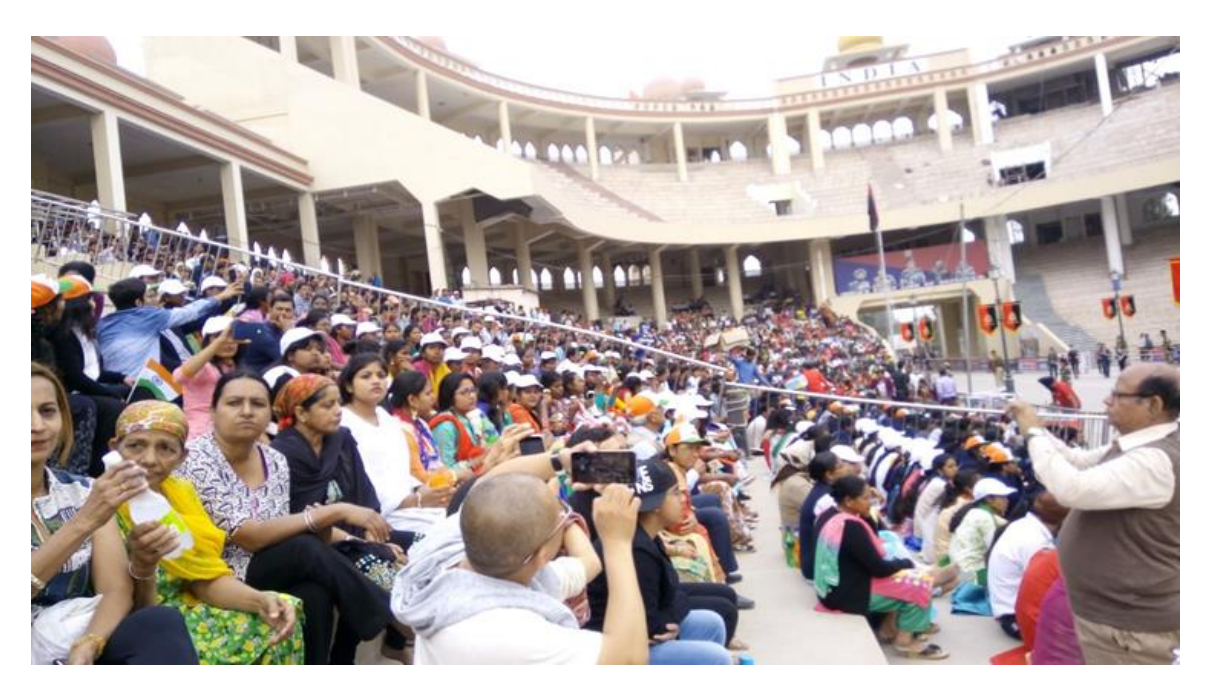
Educational Tour of students