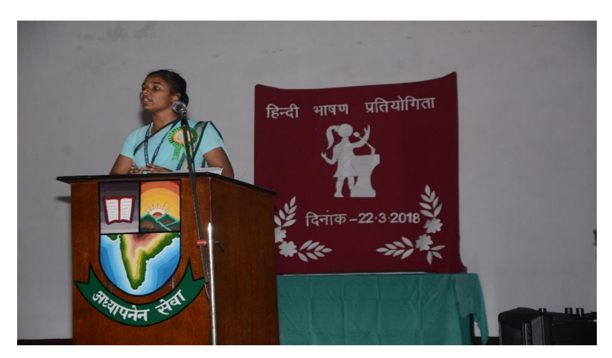
Hindi elocution competition