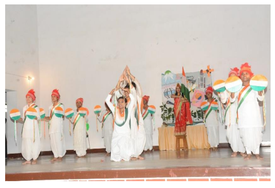
Students performing an Act on Republic Day