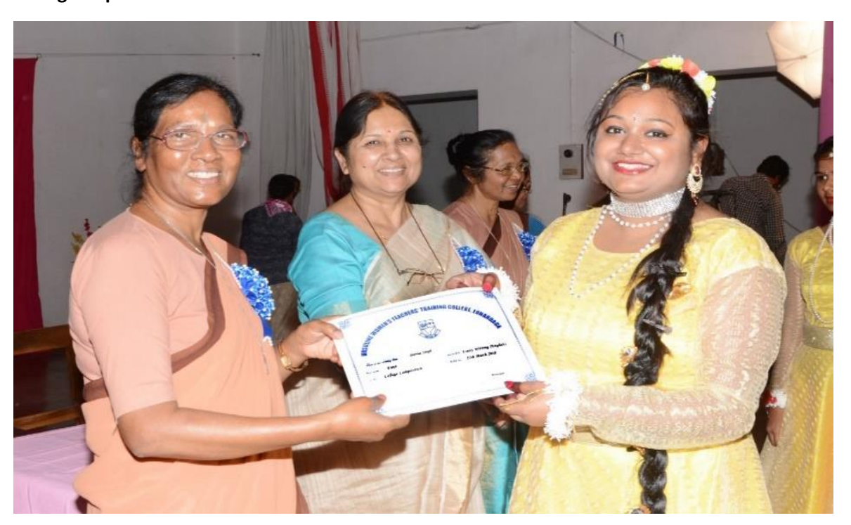
Prize distribution by Chief Guest