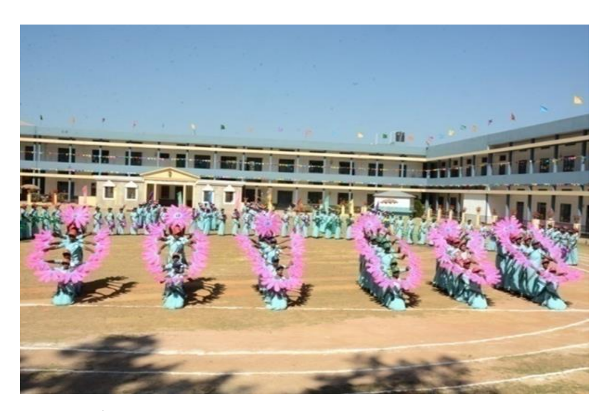
Students performing on Annual Sports Day