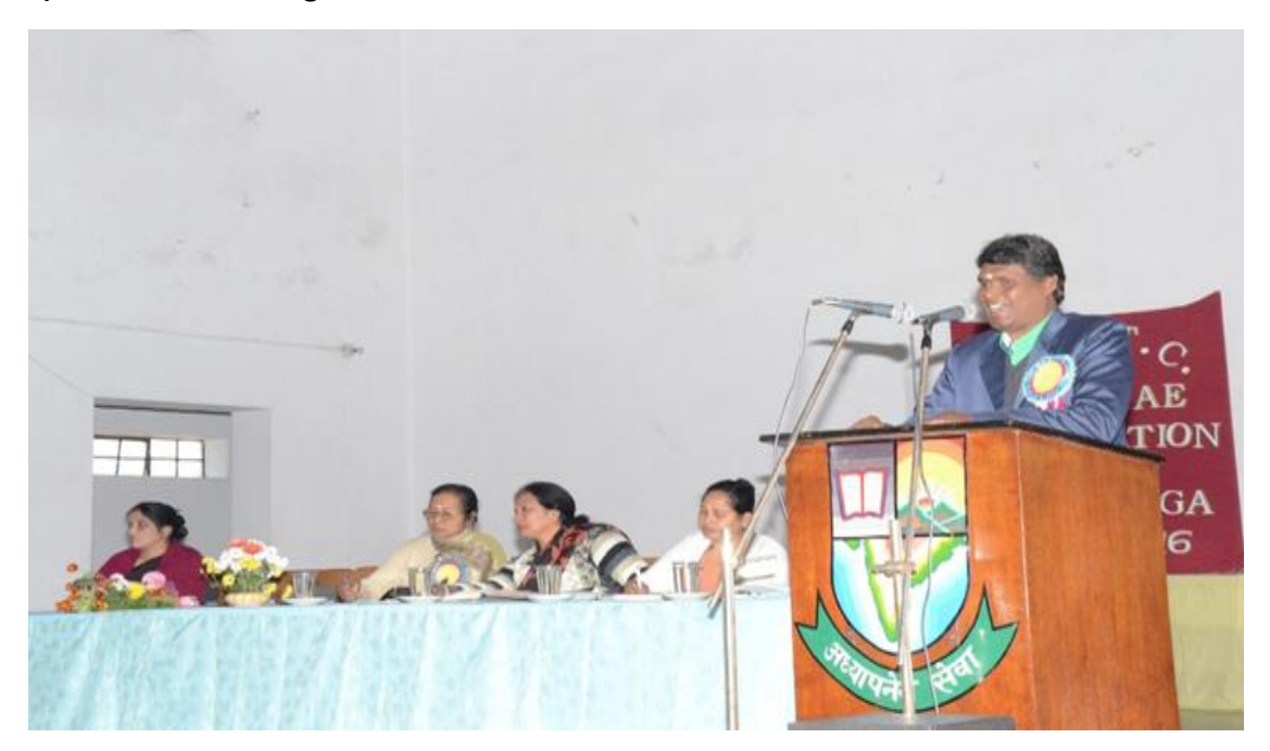
Speech by chief guest on Alumnae gathering