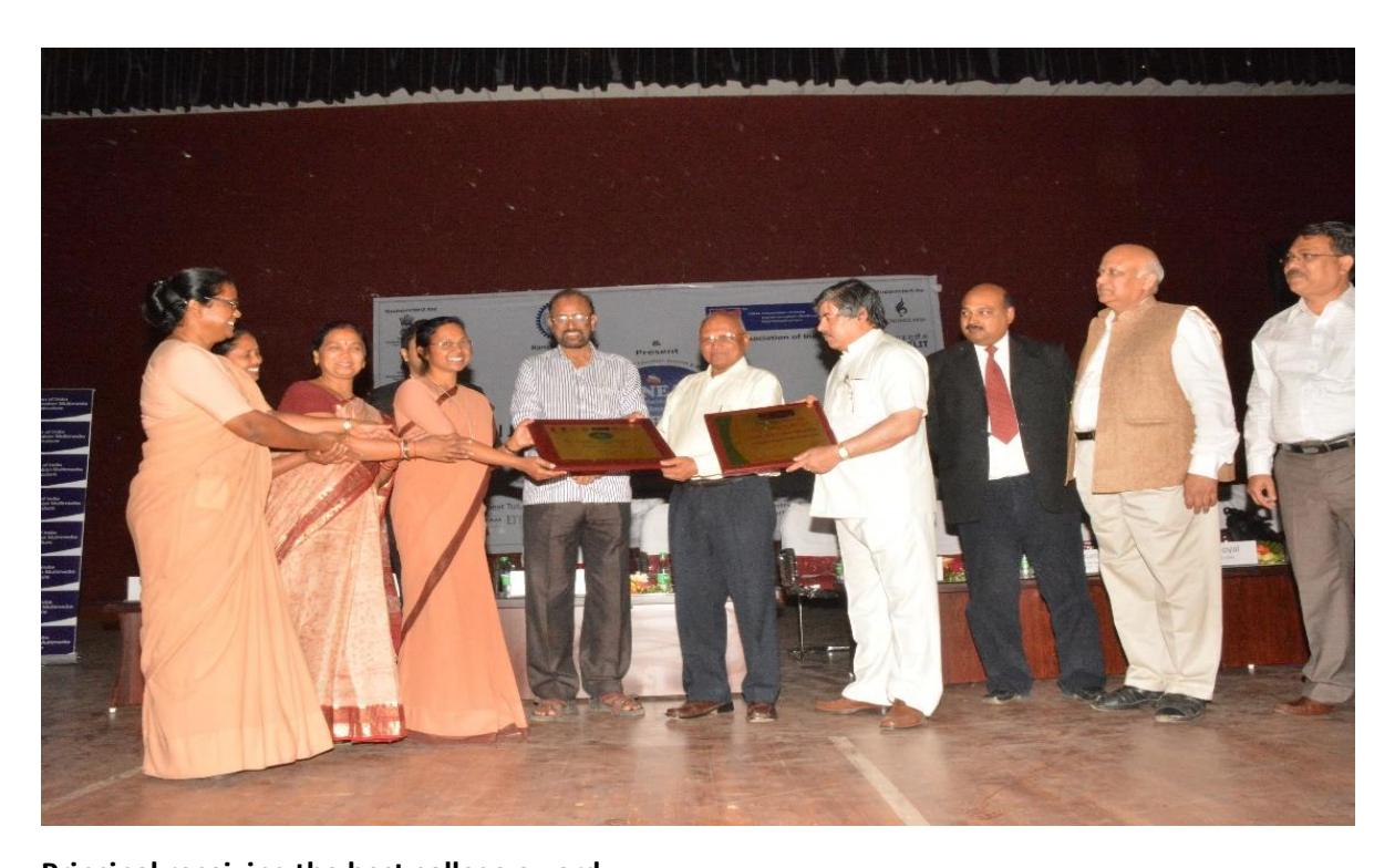
Principal receiving the best college award