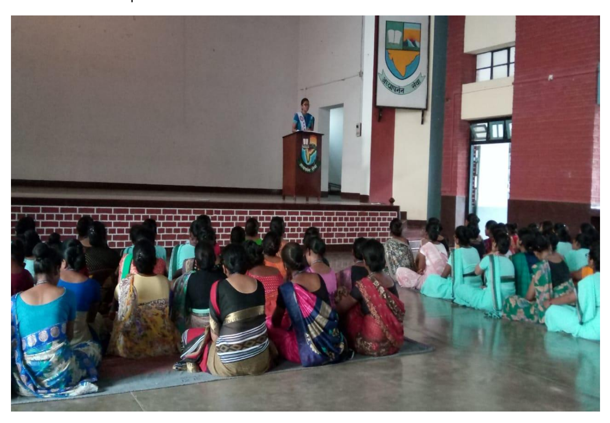
English elocution competition