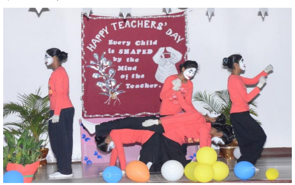
Students performing on teacher's day