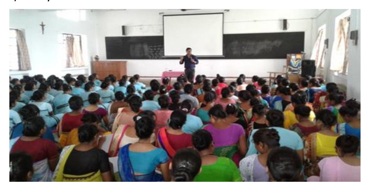
Speech on Aids day