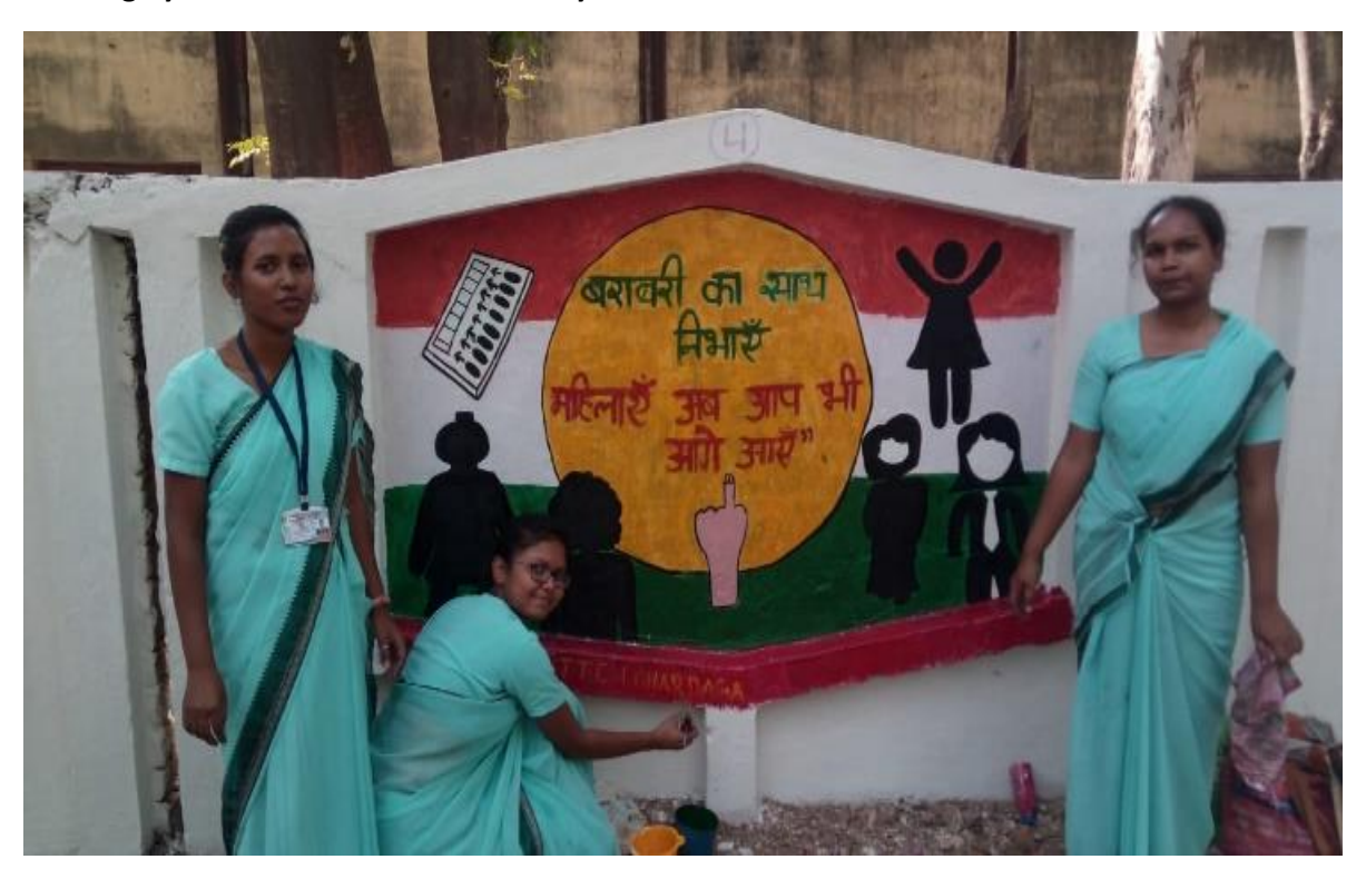
Drawing by our students on the boundary wall of D.C. office