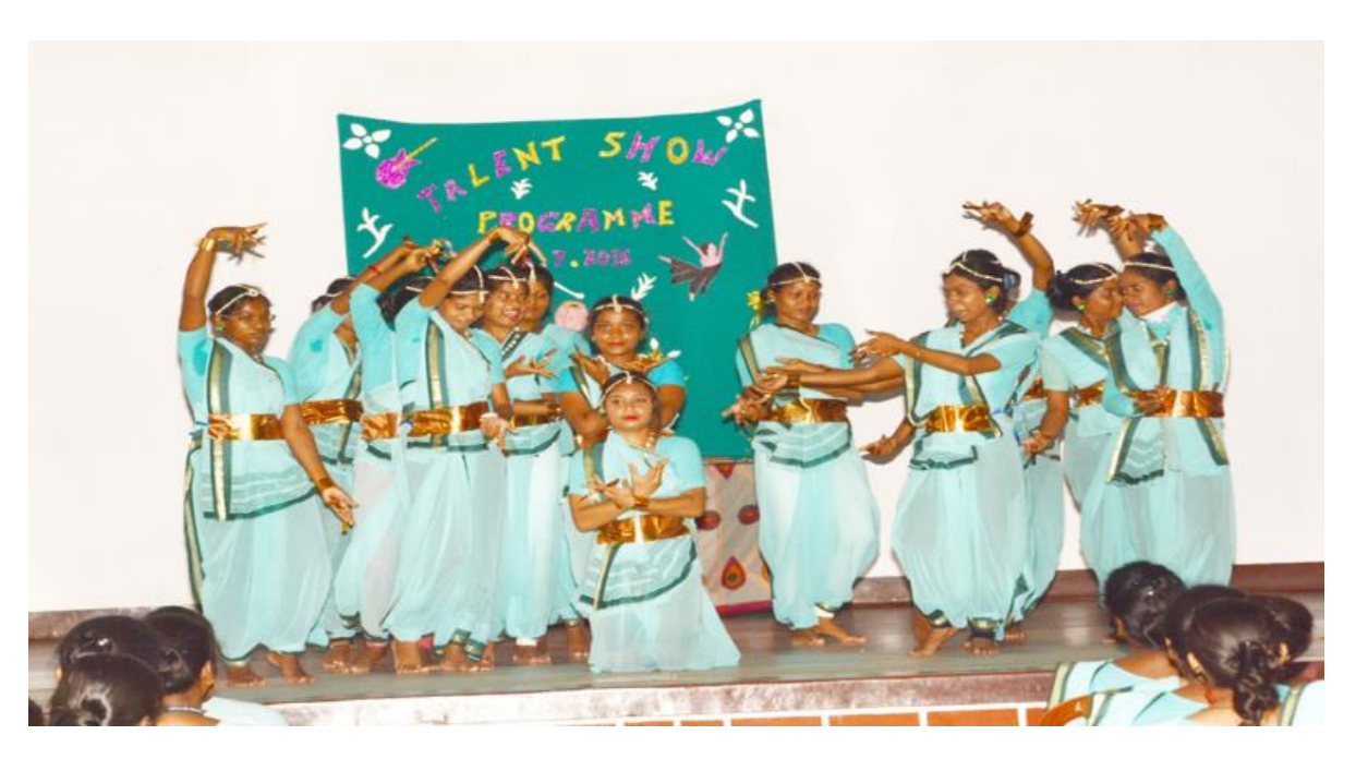
Students showcasing their talents