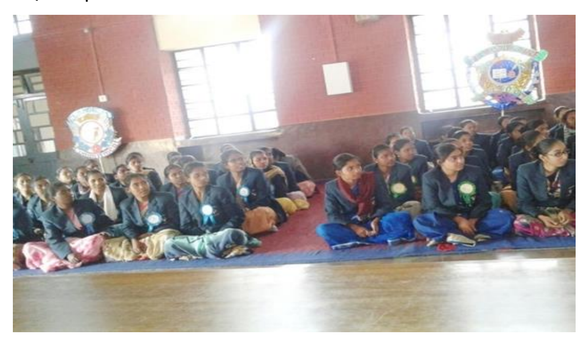
Students having quiz completion