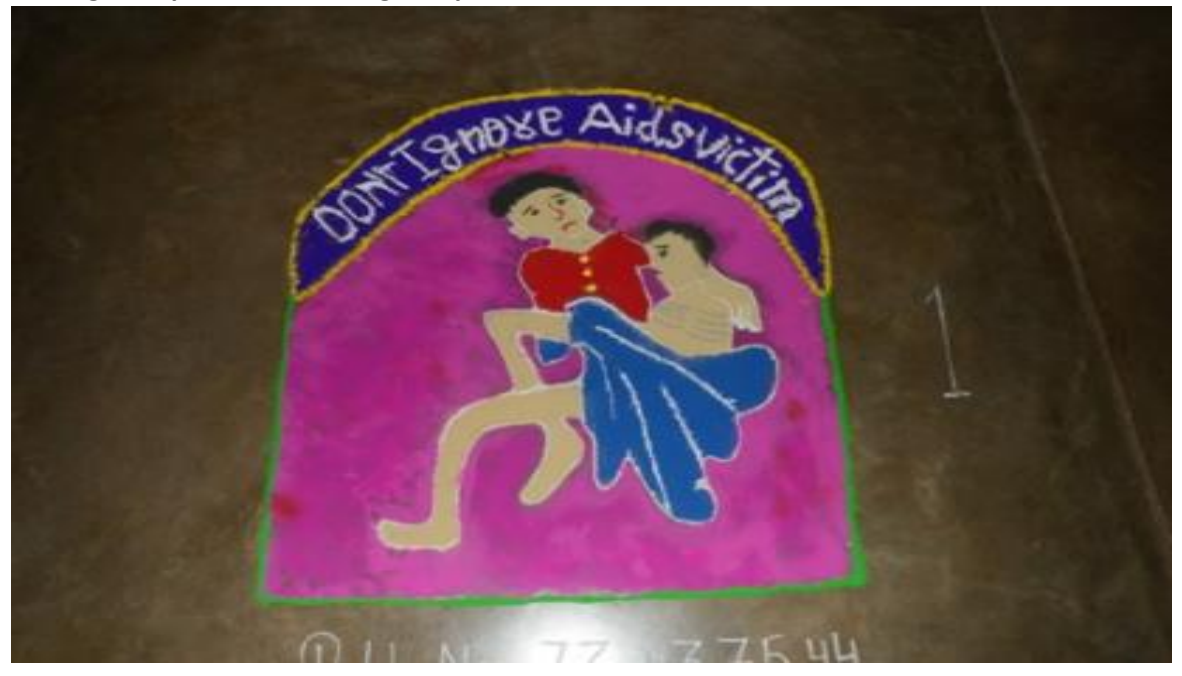
Rangoli made by students