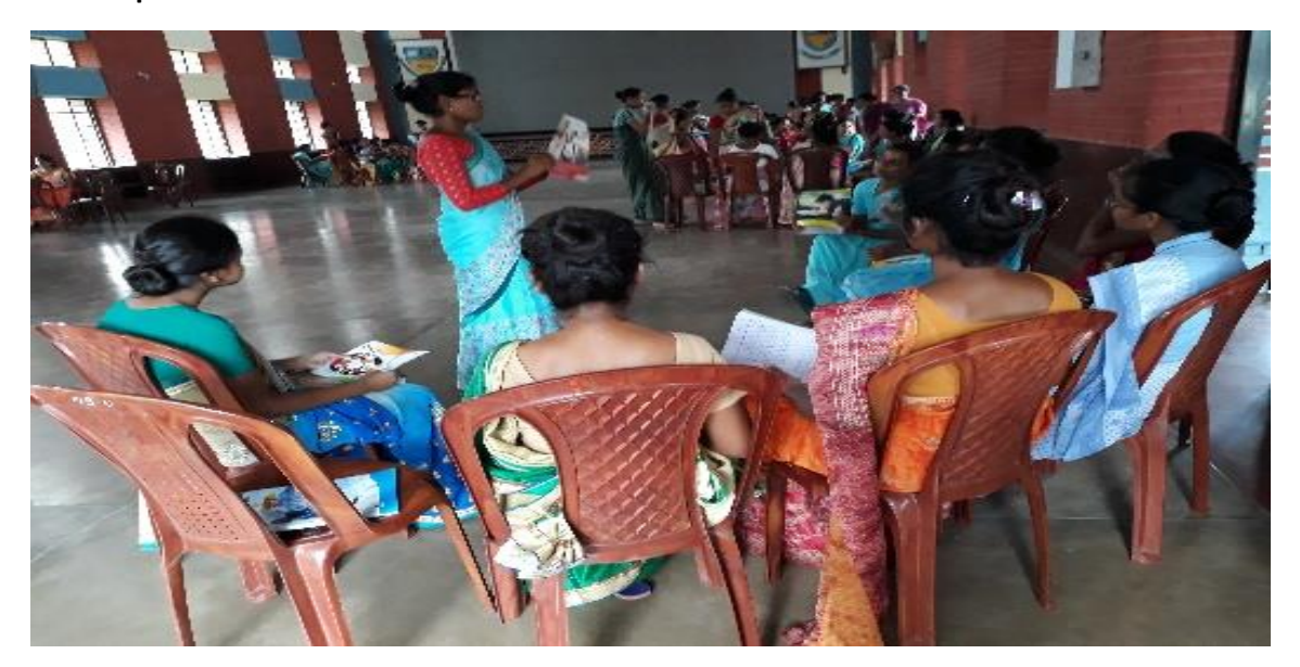
Students' group discussion