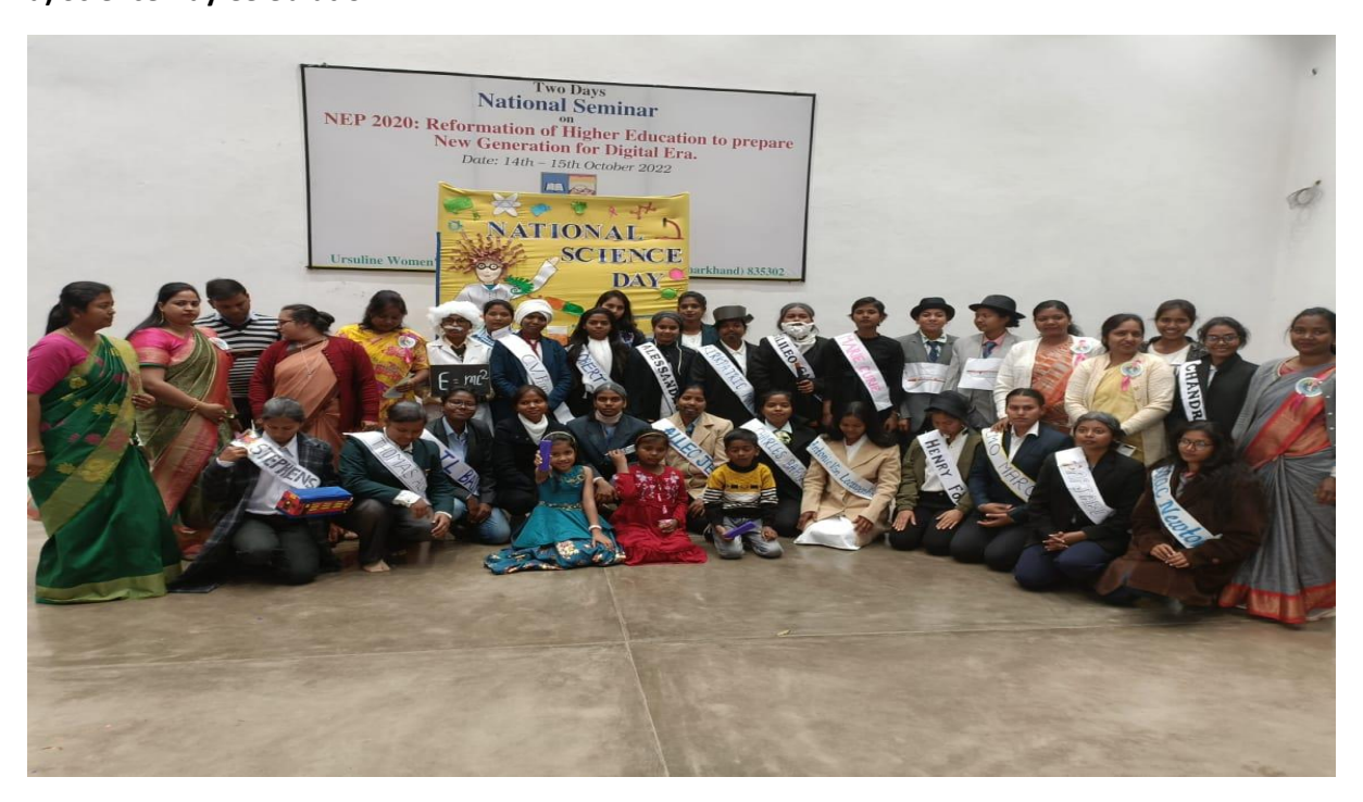
Students and teachers on Science Day Celebration