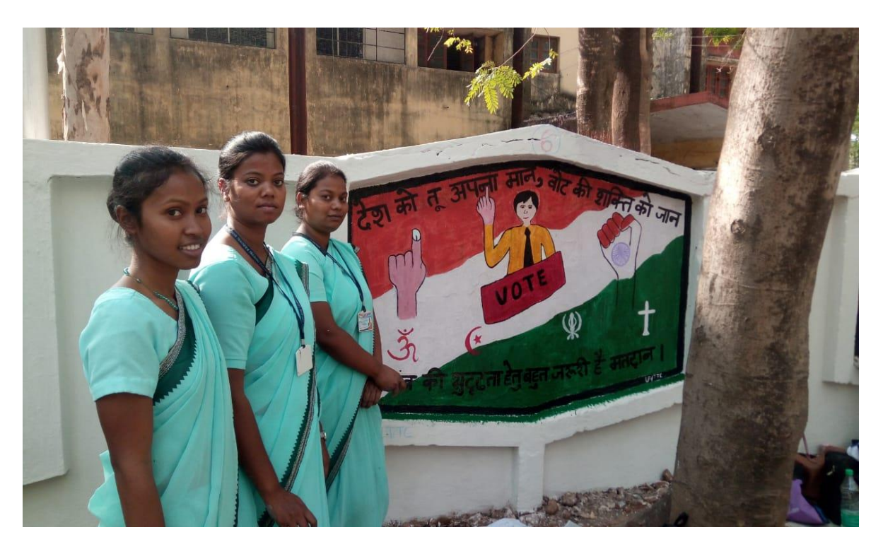
Drawing by our students on the boundary wall of D.C. office