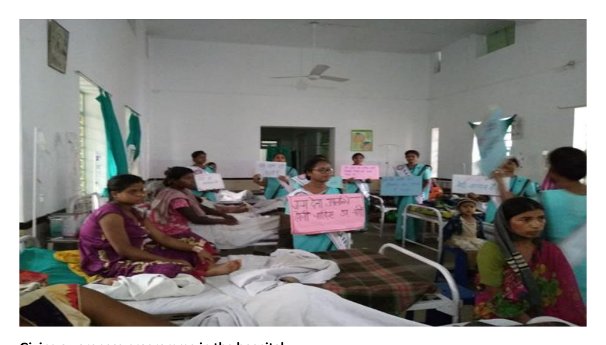
Giving awareness programme in the hospital