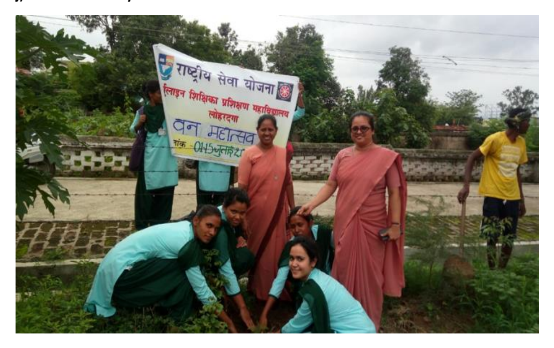
Students planting Plants